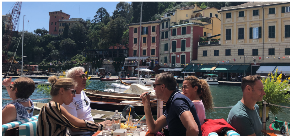
The Livery on tour in Italy