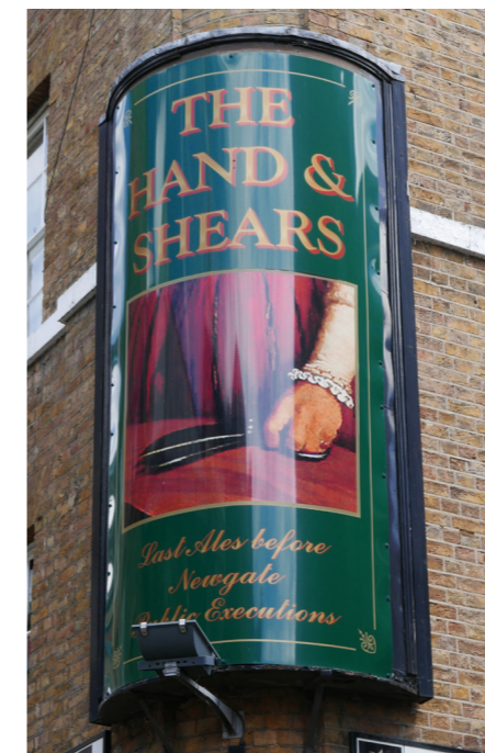
Our local pub sign recalls the original history of the Cloth Street area

Following the success of the first City & Livery Familiarisation Day in 2018 expectations for the 2019 event were high. It didn't disappoint. Attendance was excellent, with 35 members, guests and those interested in perhaps joining the Livery, attending.