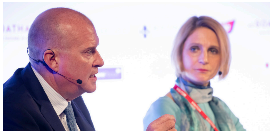
The panel addressed a range of interesting questions from the floor

Big data would be critical to this brave new world that would require strong partnerships to meet the dietary needs of an ever-increasing population. Accurate understanding of demand would be essential, he argued.