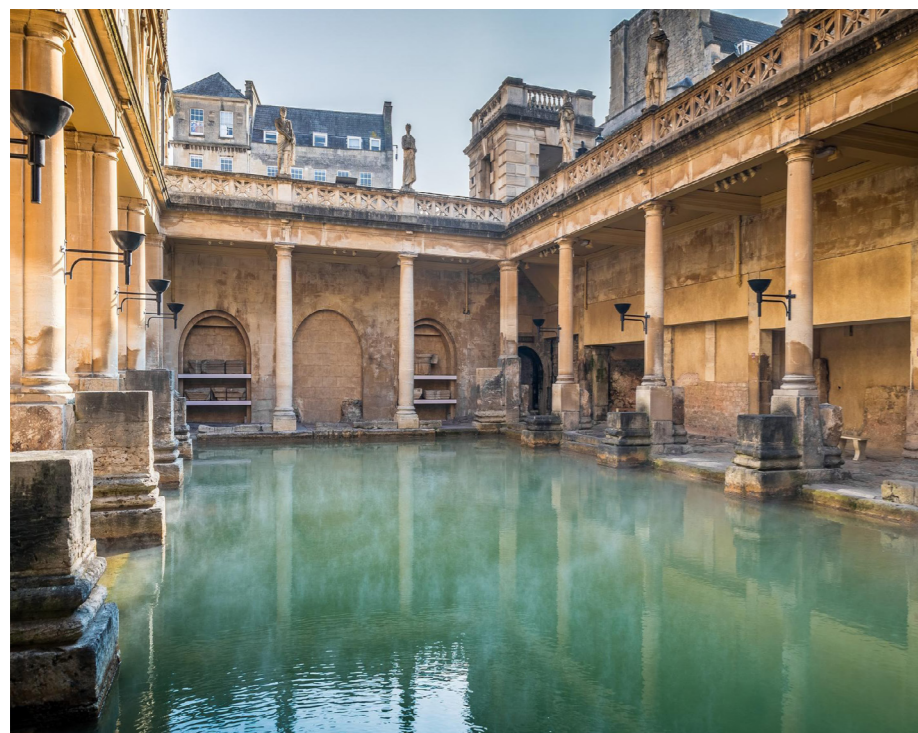
The Roman Baths – a splendid location for the Master's Drinks Reception