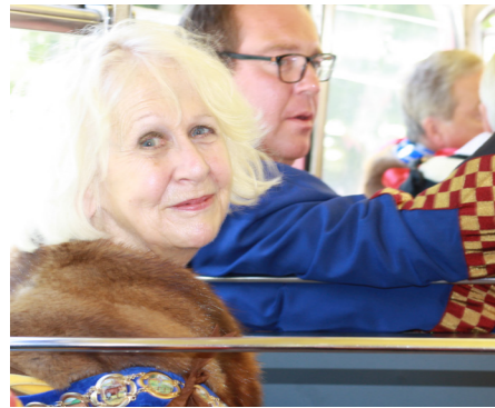
Transported in chains to the Tower of London - in an old London bus