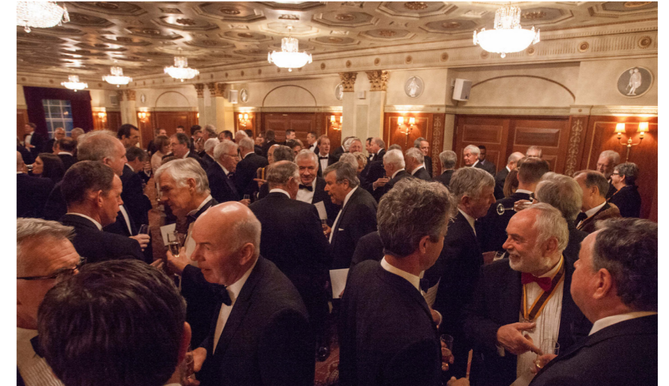
A packed auditorium for the 2019 Agricultural Lecture and Dinner