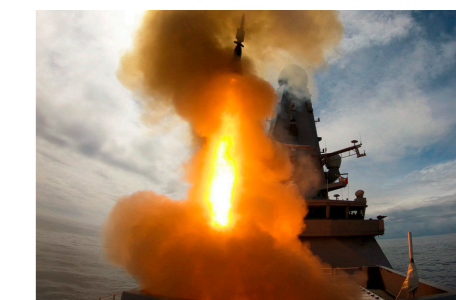
HMS Defender tests its air defence capability