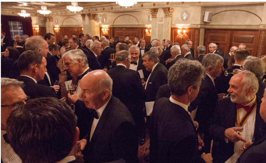
The Annual Lecture & Dinner was very well supported