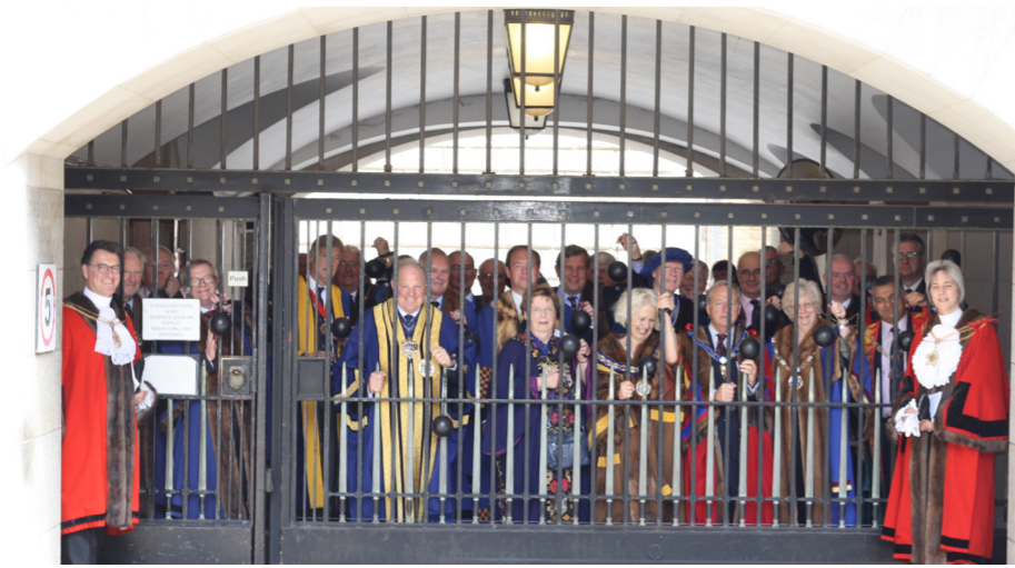
The Master incarcerated in the Tower of London.

Who knew just how dangerous being Master of the Worshipful Company of Farmers could be! Following a malicious report from our otherwise totally loyal Clerk, the Master suffered the indignity of arrest followed by trial, for her alleged misdemeanours in Court No 3 at The Old Bailey and conviction. The sentence seemed harsh. She was sent down, pending bail and along with a motley crew of other felons (many also Liveryman and officials) transported, escorted by the Queen's Guard, directly to the Tower of London, wearing a ball and chain. Albeit on an old London bus.