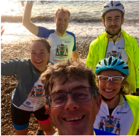
The joy of finishing Sleepless in the Saddle

Inspiring, encouraging and developing excellence in the management and leadership of UK agriculture