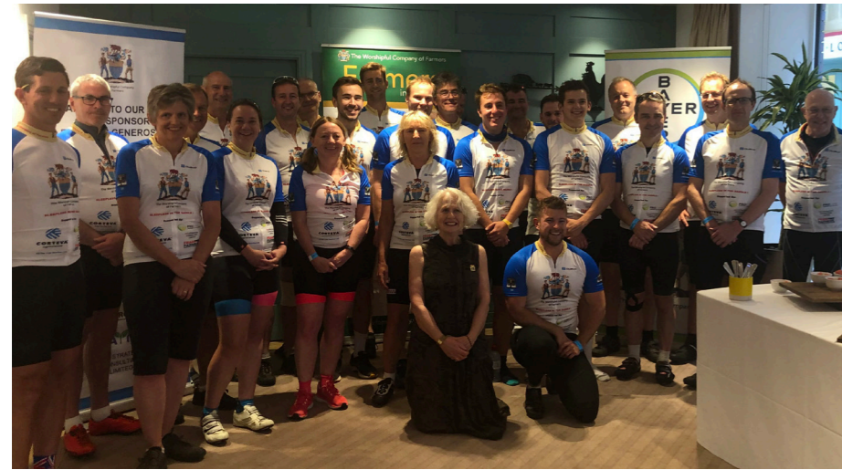
The Master and the Sleepless in the Saddle riders at Farmers & Fletchers Hall