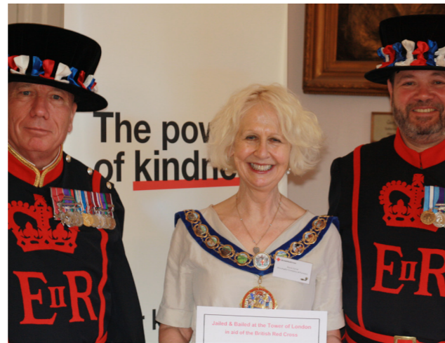
Bailed with a cheque in favour of the British Red Cross

The Clerk reports that it can't have been too bad an experience as all the convicted, as can be seen in the pictures, seemed to thoroughly enjoy their day of infamy, in part perhaps because they were served Pol Roger throughout the experience. A luxury unlikely to have been on hand in the days of Anne Boleyn or Sir Thomas Moore!