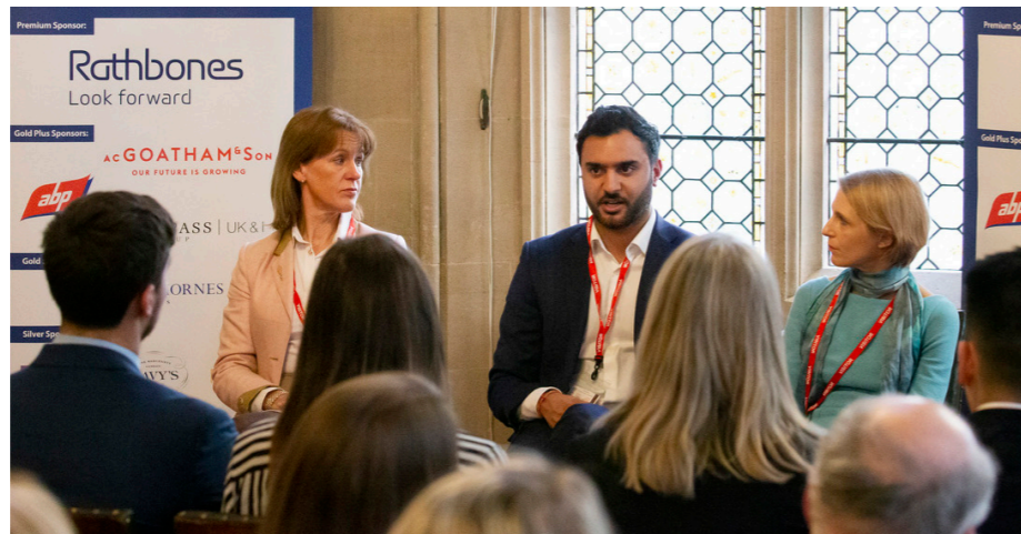
Lively discussion followed the lecture