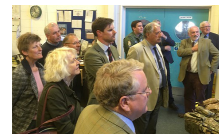
Survival training was part of a full day at RAF Waddington