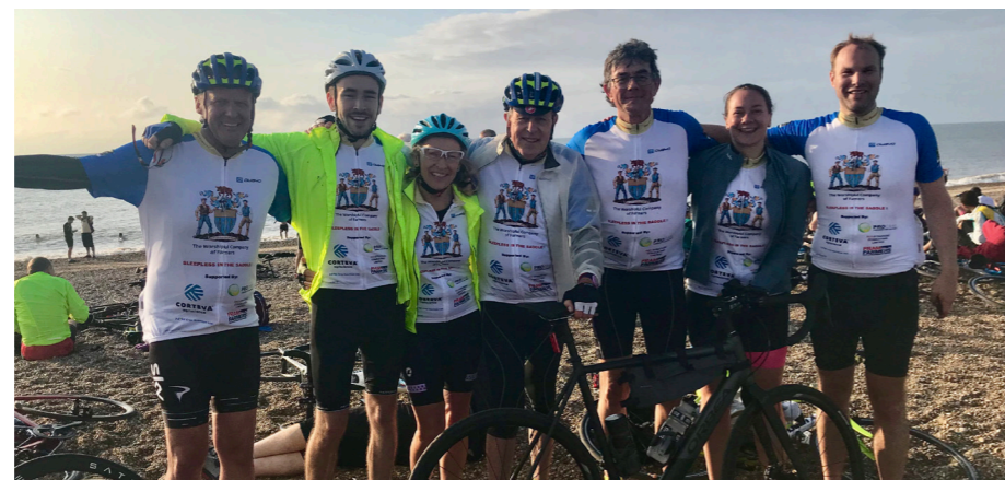
Finally on the beach

Our riders, resplendent in our specially designed event shirts cycling shirts, generously sponsored by Corteva , our keynote sponsor, Fram Farmers , Payne Crop Nutrition , ProCam and RED Design , arrived at Dunwich, on the Suffolk coast, our final destination,