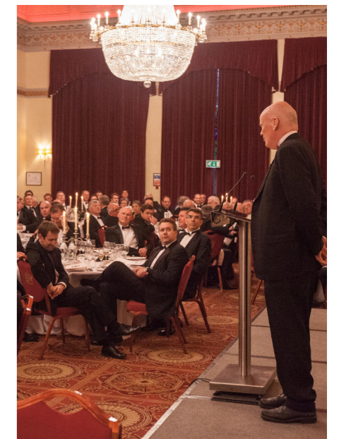
Liverymen, guests and sponsors listen attentively to an excellent lecture