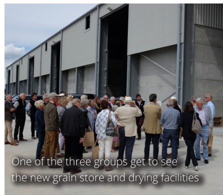
One of the three groups get to see the new grain store and drying facilities