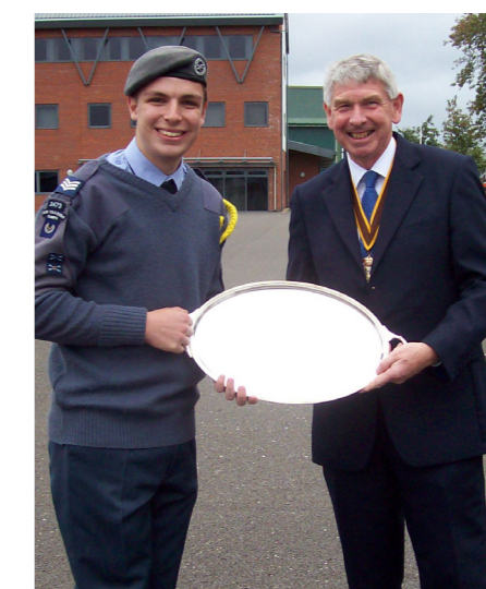
The Master presents the Livery Salver to winning Squadron - 2473 Highlands & Southgate

There is intense competition between the squadrons as they undertake a range of activities - including very realistic first aid demonstrations, model aircraft construction and individual music battles. The winner of each competition is presented with an award and there is obvious joy within the