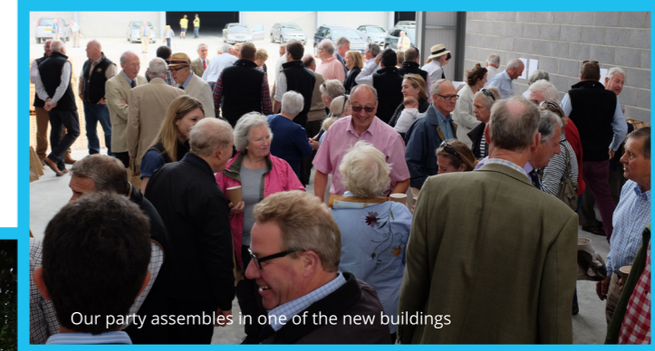
Our party assembles in one of the new buildings

gradually better all day, was superb which meant that pre-dinner music and drinks on the terrace, overlooking a wonderful view down through the gardens was a joy. Speaking about the visit, planned