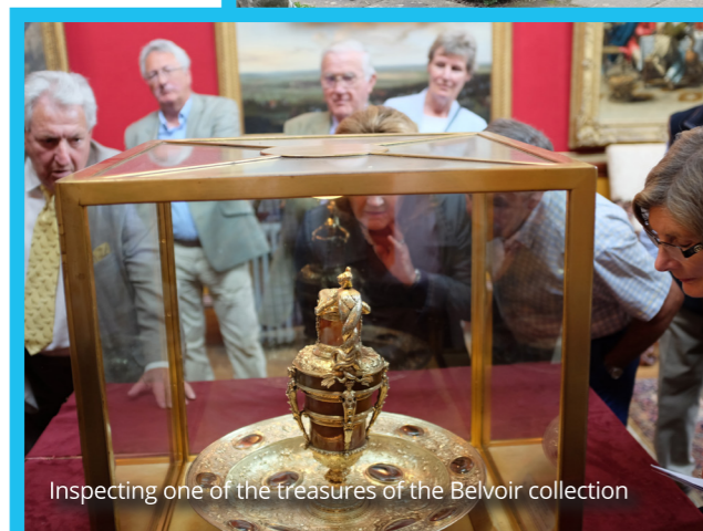
Inspecting one of the treasures of the Belvoir collection

comparisons with the previous day's tour at Nocton. The history of the two estates could not be more different. But there were commonalities. The drive to be the very best, the attention to detail and the hard-headed attitude to what makes good financial sense.