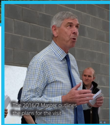
The 2016/7 Master outlines the plans for the visit

Belvoir Castle crowns a prominent hill in Leicestershire. In the simpler landscape of the period immediately after the Norman Conquest, when