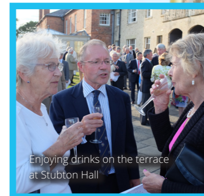
Enjoying drinks on the terrace at Stubton Hall

A splendid one hundred and twenty guests attended the evening function. The weather, which had been getting