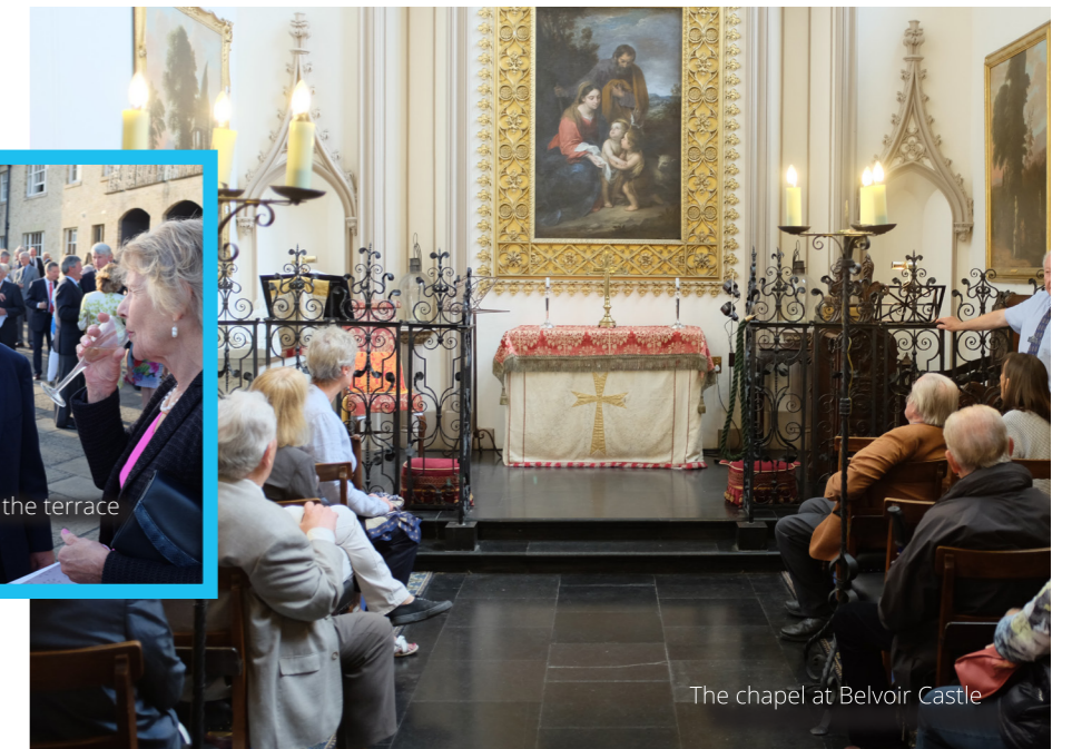
The chapel at Belvoir Castle