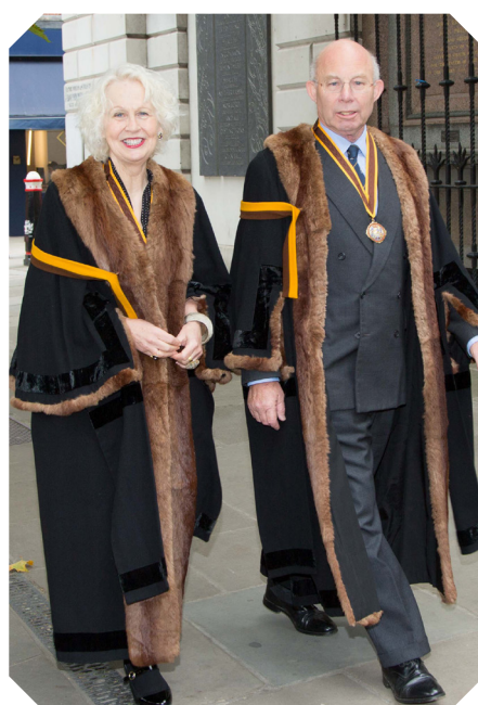
The Wardens make their way to the Installation Luncheon