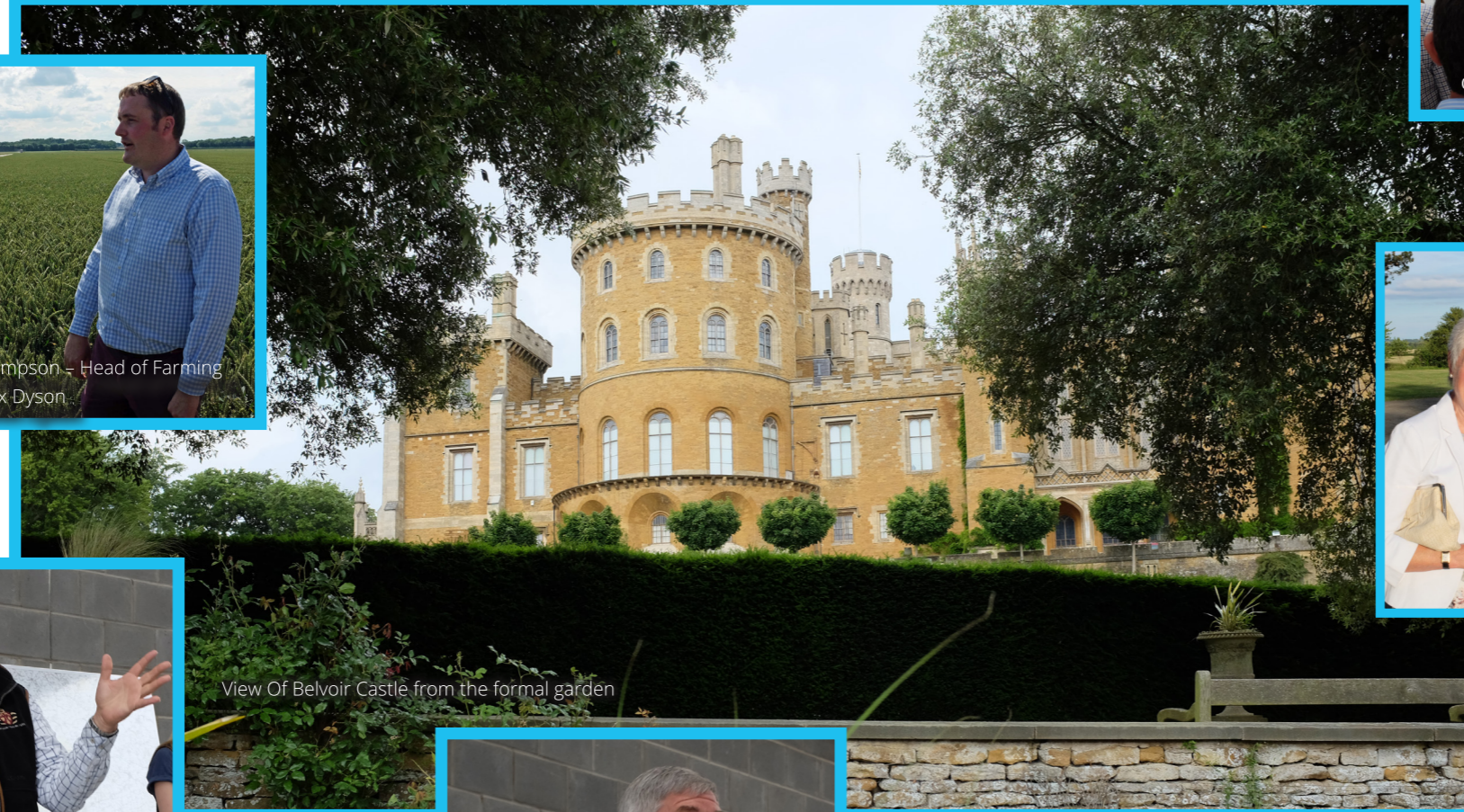
View Of Belvoir Castle from the formal garden