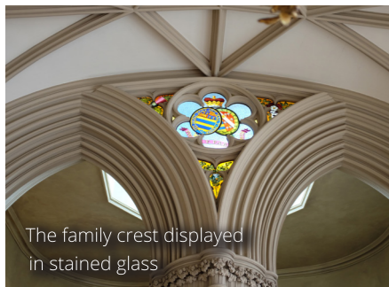
The family crest displayed in stained glass