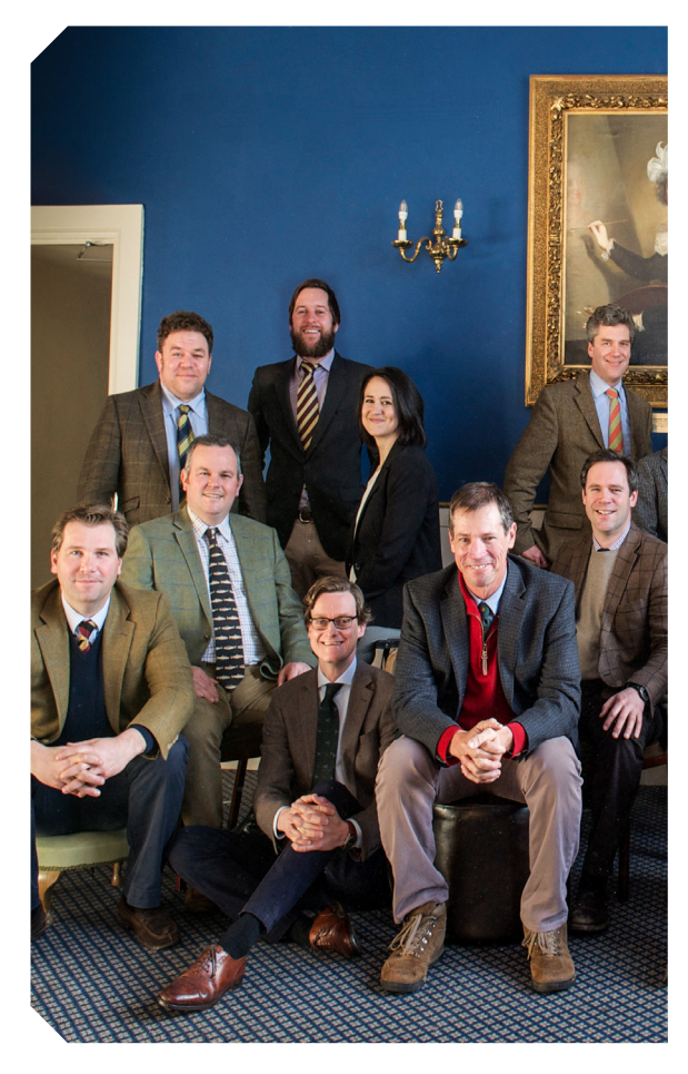
ACABM The Class of 2017