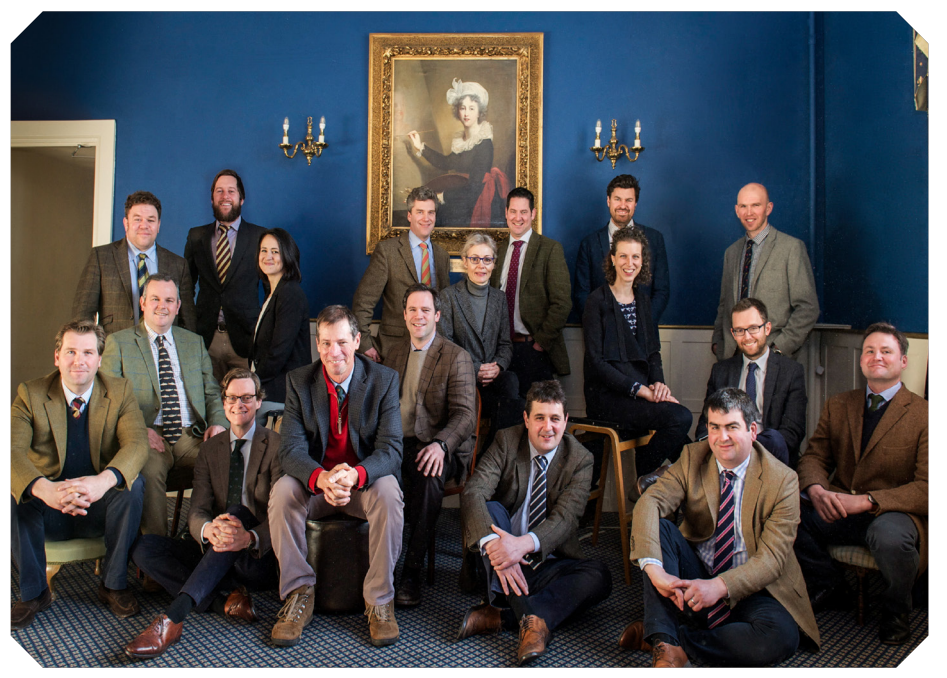
ACABM The Class of 2017