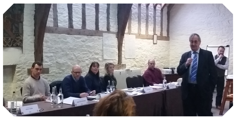
Delegates enjoy the benefits of stunning surroundings at the Duchy College

We all had opportunities to be the chairperson for the day to fine tune our leadership skills. Every participant had to present to the group on our background, our farming business, our goals and aspirations which was so impressive, exhilarating and challenged us to push ourselves further to keep up with the amazing people we were surrounded by. The course concluded with a champagne reception with the Master of the Worshipful Company of Farmers and some of their senior members PLUS the UK Minister of Agriculture attended and addressed this function.