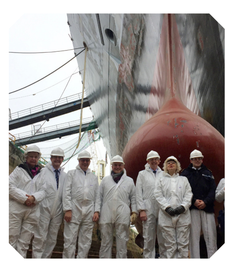
The Affiliation Committee visit to Defender

The Livery has arranged for a small group of 12 Air Cadets to visit the New Holland Ford Tractor factory in Basildon on 4th April 2017, and it is hoped if this is successful it will be an annual visit which will link-in with their STEM (Science, Maths, Engineering and Technology) studies.