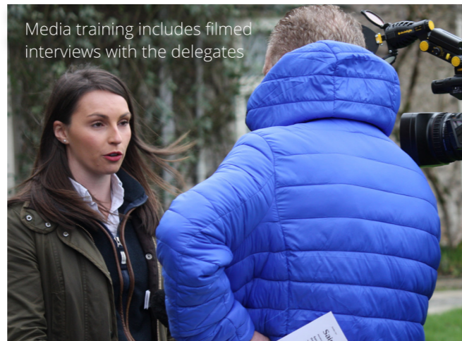
Media training includes filmed interviews with the delegates