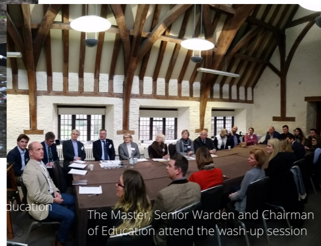
The Master, Senior Warden and Chairman of Education attend the wash-up session

The sense was that from interview to final wash-up, the process and the people had been exceptional. The course was certainly a challenge