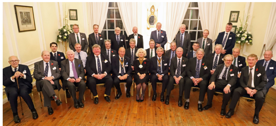
Liverymen from across Lincolnshire gathered to honour the new Master