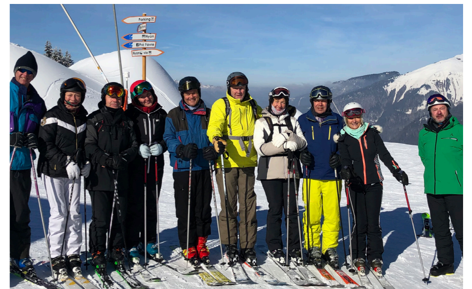
Ski team and supporters in beautiful Morzine