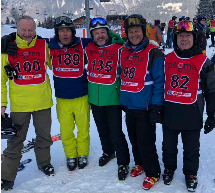
The 2019 WCF ski team

Inspiring, encouraging and developing excellence in the management and leadership of UK agriculture