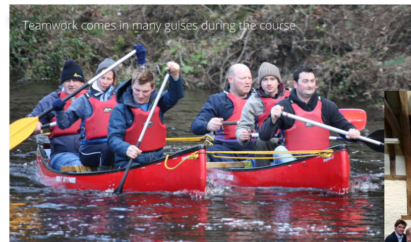
Teamwork comes in many guises during the course

The sense was that from interview to final wash-up, the process and the people had been exceptional. The course was certainly a challenge