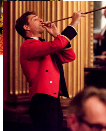
The poste horn chase was exceptional