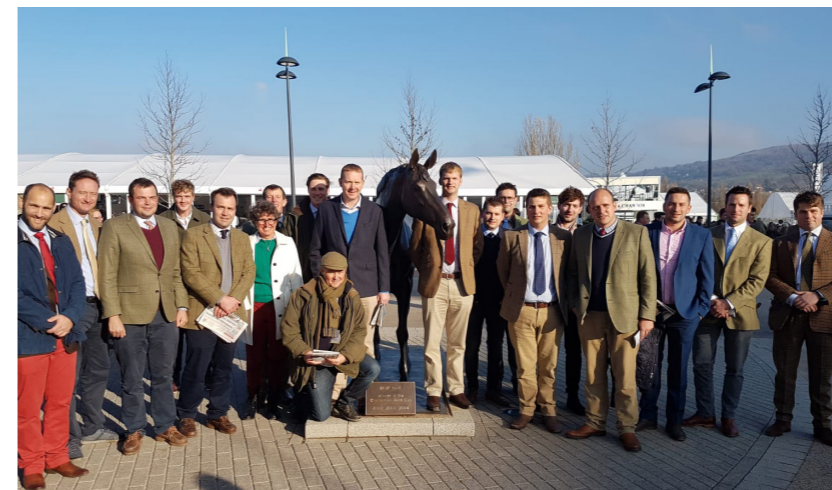
Delegates spent an afternoon at Cheltenham Racecourse