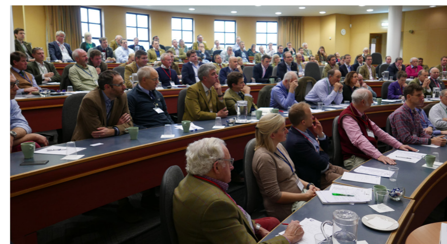
Delegates in the plenary session at the 2019 Learning Extension Day

they would recommend attending to friends and colleagues.