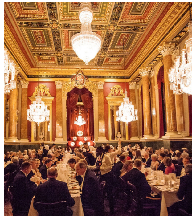
Goldsmiths Hall splendid by candlelight

The Master chose Goldsmiths' Hall for the 2019 Banquet and as over two hundred of us took our places in the Great Hall, delightfully illuminated by natural candlelight, it felt very special indeed. Masterminded wonderfully by the Clerk, aided this year by his new Assistant Clerk, the evening went off flawlessly.