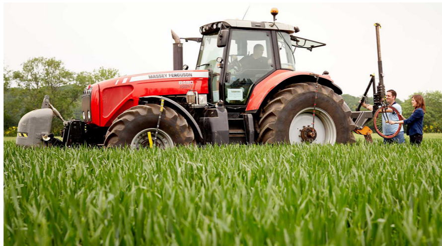
The new APTA course aims to bridge the gap between the new technology and farmers who might use it

The Company's new course, delivered by Harper Adams University and sponsored by the NFU Mutual – was officially launched at the NFU Conference in Birmingham on February 20th and at the same time receiving the name "Adopting Precision Technology in Agriculture". The first course commences on 11th November 2019 at Harper Adams University and takes the form of three, one-week blocks, with the last block concluding on the 26th June 2020.