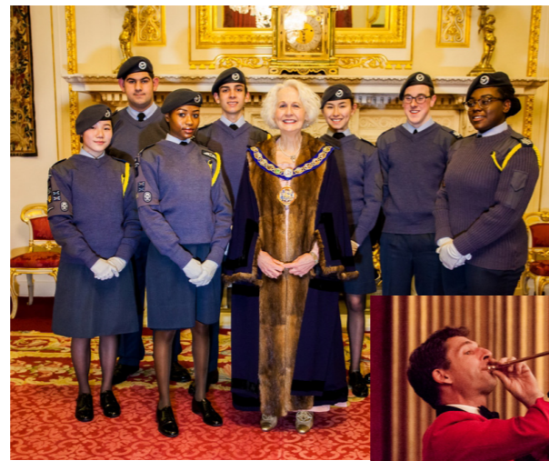
The Middlesex Wing ATC team and Master