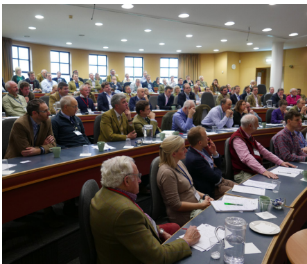
Delegates attending the 2019 inaugural WCF Learning Extension Day