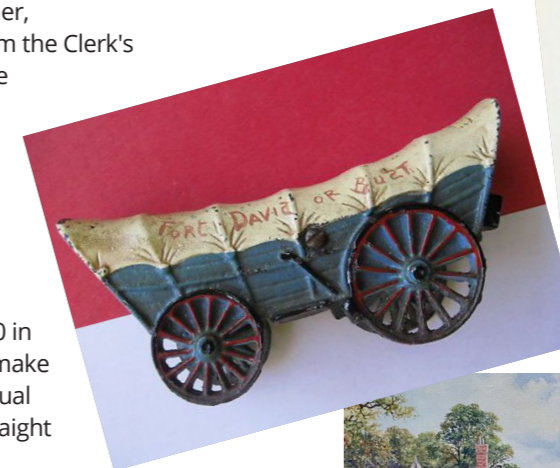
An international entry from the editor a covered waggon money box