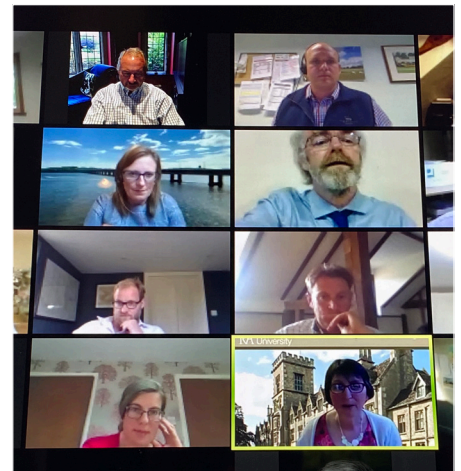
ZOOM introduction for 70th ACABM delegates

Applications for both courses are being accepted immediately and pressure for places is expected to be high so if members of the Company or the alumni know of individuals who might benefit from attending, the advice is to get an application in sooner rather than later.