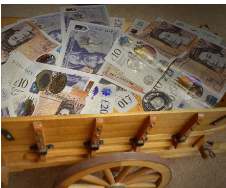
Just one of the entries for the Clerk's 'Farm Cart Photo Competition'