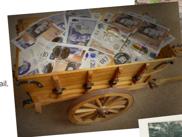
Your editor submitted this, a neat bit of Photoshopping, but is that cheating?