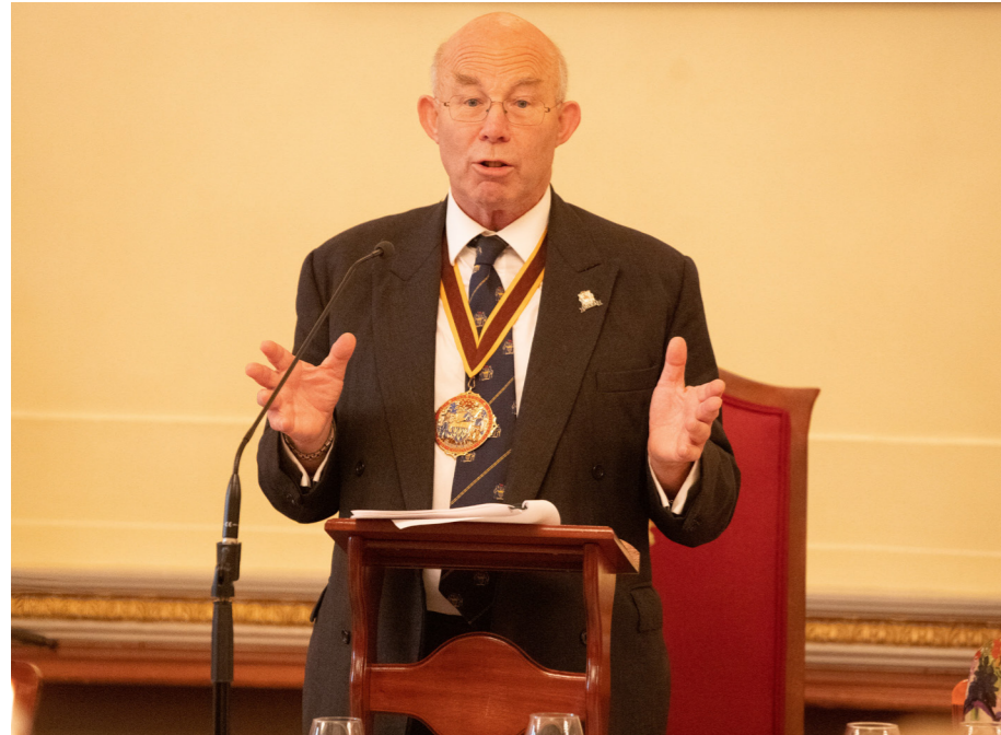
The Master addresses the Company before 'lockdown'

To-date, little about my year as Master of the Worshipful Company of Farmers could be described as normal.