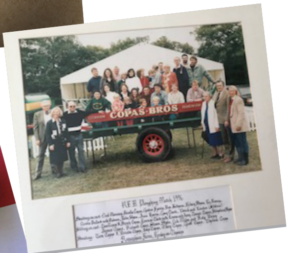
One of a number of pics from the family archive