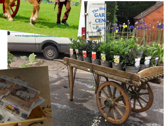
John Pudge submitted this pic, not quite a 'farm cart' perhaps but a fine display none-the-less