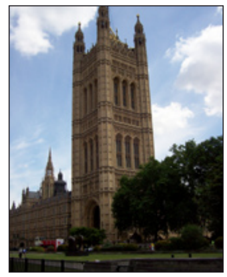
The Victoria Tower at The House of Lords

The following day many of the party went on a tour of the Houses