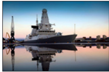
Defender leaving por

The photograph is of Defender leaving port on her first day of active service.