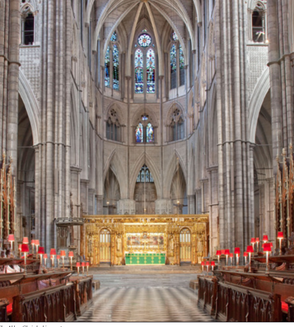
The Abbey Choir looking east

team for serving in very cramped conditions.