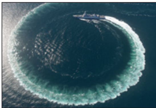
HMS Defender demonstrating her tight turning circle

Our affiliate ship, the brand new type 45 destroyer HMS Defender, since her return to Portsmouth in December has had a period of very intensive training to prepare her and her crew for an arduous nine month deployment in