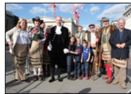
The Sheriff of Rutland centre stage

This is a fun event with the Farmers gathering in the Mudlark pub across the road from Glaziers Hall beforehand and not surprisingly retiring to the Mudlark for a well-earned refresher.