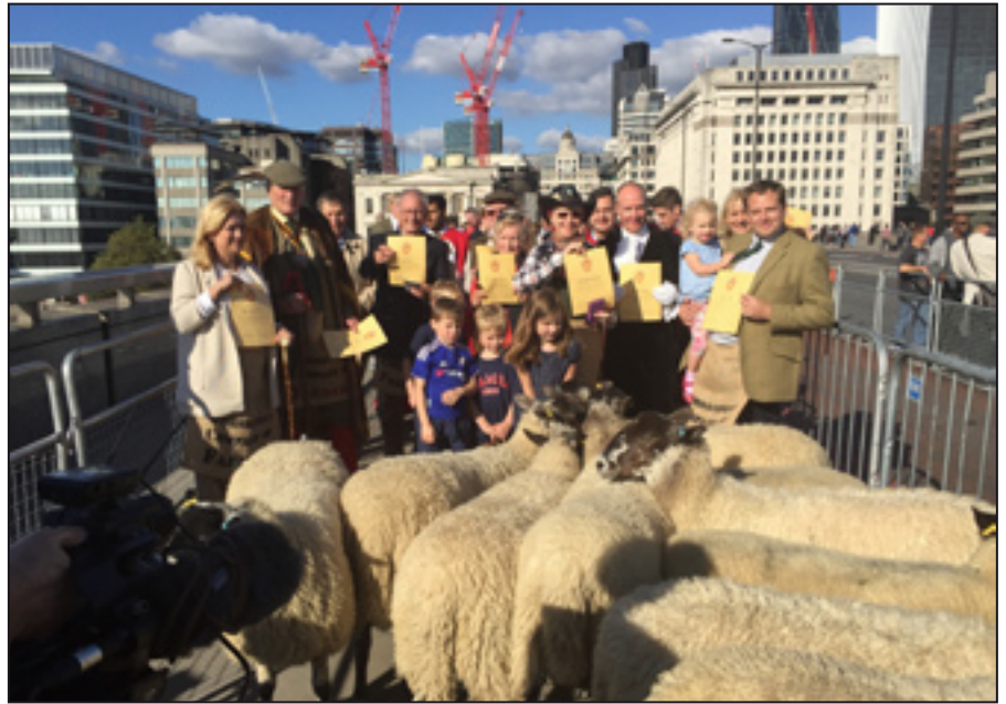
The Farmers Team with 'Friends

On Sunday September 27th The Worshipful Company of Farmers fielded a team of ten Liverymen to exercise our rights as Freemen of the City to drive sheep across the bridge.