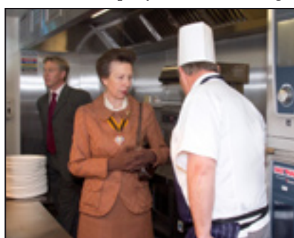
How does everything work?

She then met the representatives of the Fletchers' Company before unveiling